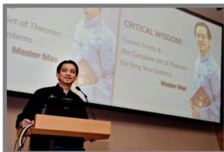
Mas Kehardtham, Thailand